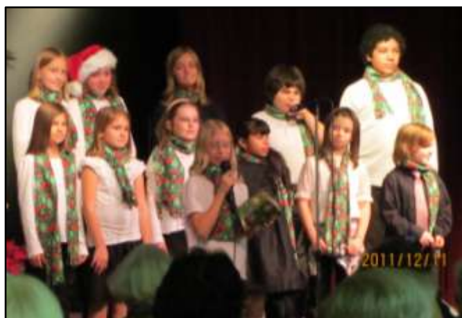
4C on stage December 11 at CLP Christmas Dinner